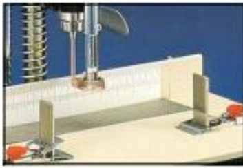
Easy Paper Alignment

The Lihit 1013 is a Multi-purpose Paper Drill. The heavy-duty motor helps you to drill more paper faster. 13 different drills from 2.5mm to 12mm in diameter can be used. The hexagonal pitch bar makes choosing hole patterns easy and quick. The Machine can drill up to 50mm of paper per cycle. Both the paper guides and the paper guide pressure clamps keep the paper in position for accurate and safe drilling.